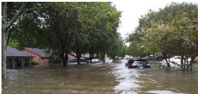
Photo taken as we evacuated our home by boat.

So much of the challenge is the waiting. People have been waiting – for it to stop raining; for the waters to recede; for help to clear